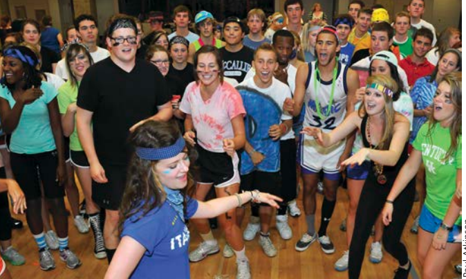
First-year students and student orientation leaders compete in the Orientation Olympics at the Beck Center.

The class of 245 first-year students and 14 transfer students includes 34 Kentucky Governor's Scholars and Governor's School for the Arts participants and six National Merit Finalists. Eighteen percent come from 18 states outside of Kentucky and from four foreign countries—China, Hungary, Nigeria, and Taiwan. These new students bring overall fall enrollment to 1,029.