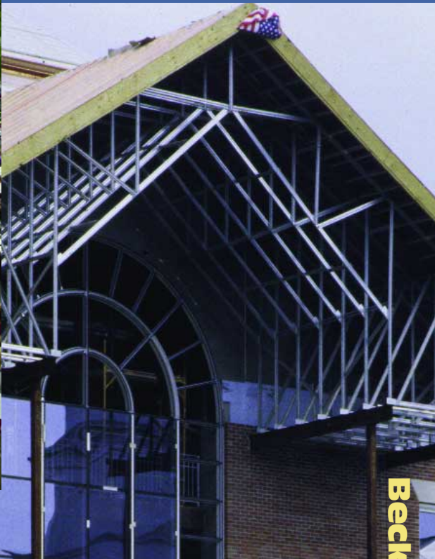
Beck Center construction