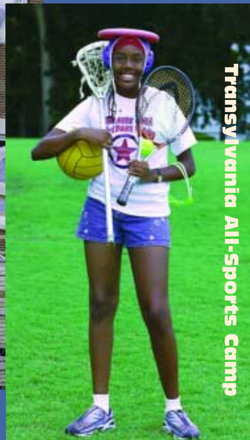
Transylvania All-Sports Camp