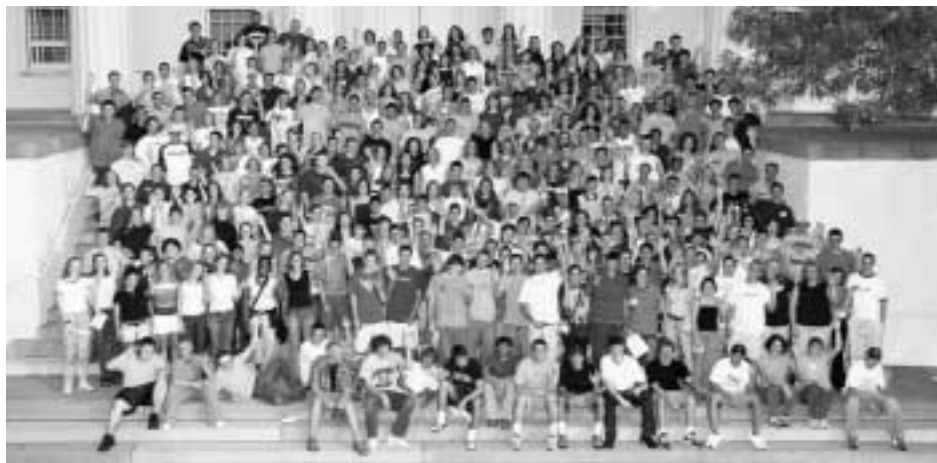
■ Transylvania class of 2005