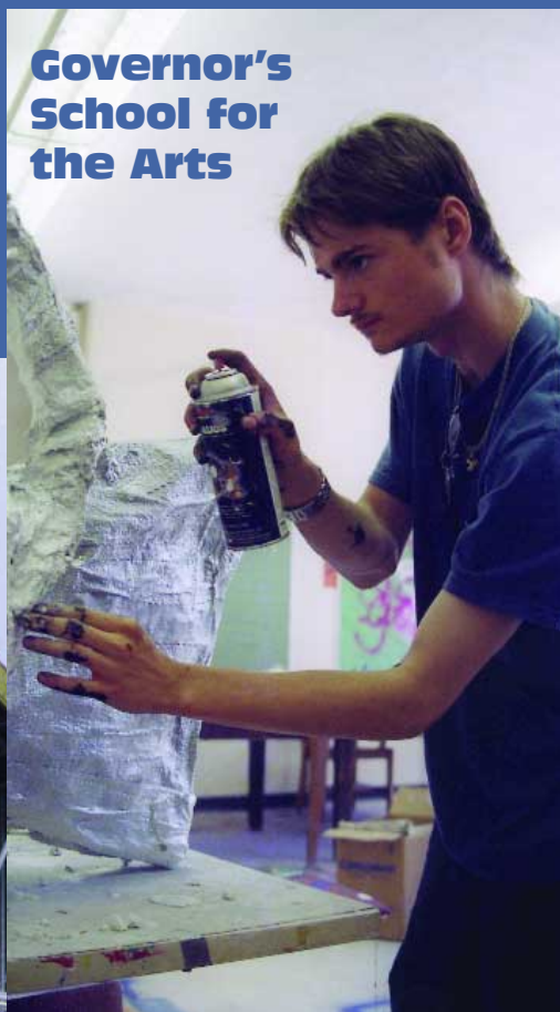
Governor's School for the Arts