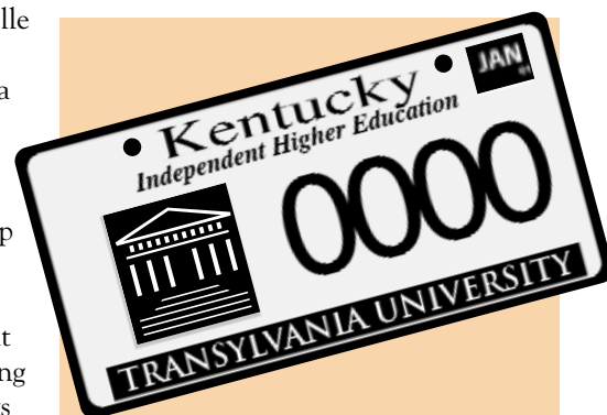
■ Transy license plates support scholarships at the University.

Alumni and friends of Transylvania can now show their school spirit and support scholarships for Transy students through a new series of Kentucky license plates.