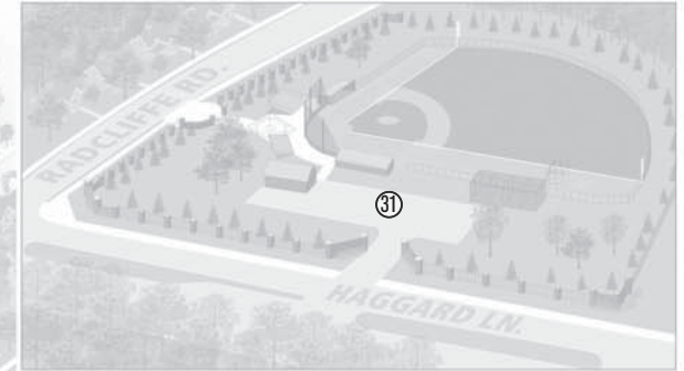
To William A. Marquard Baseball Field—about two miles from campus, on Haggard Lane