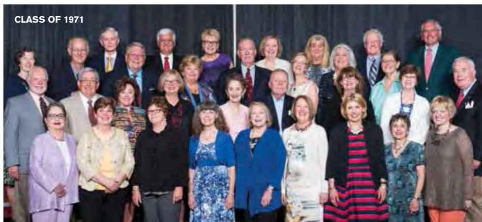
CLASS OF 1971