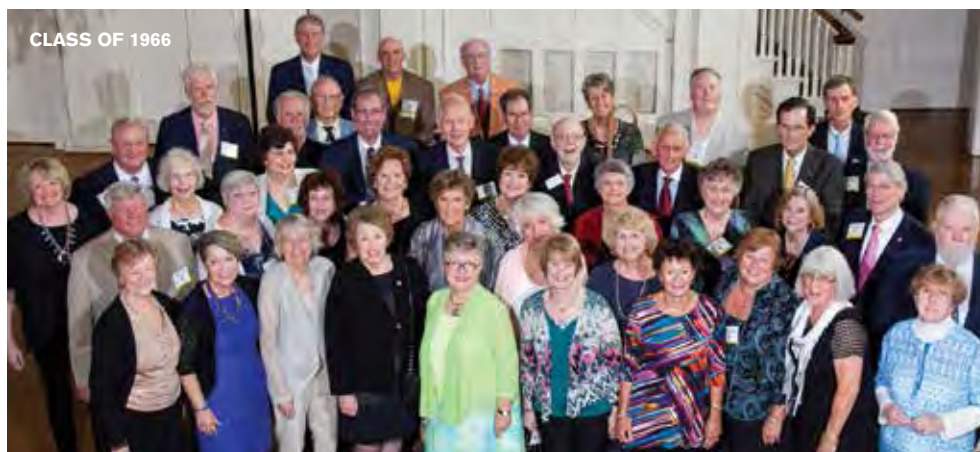
CLASS OF 1966