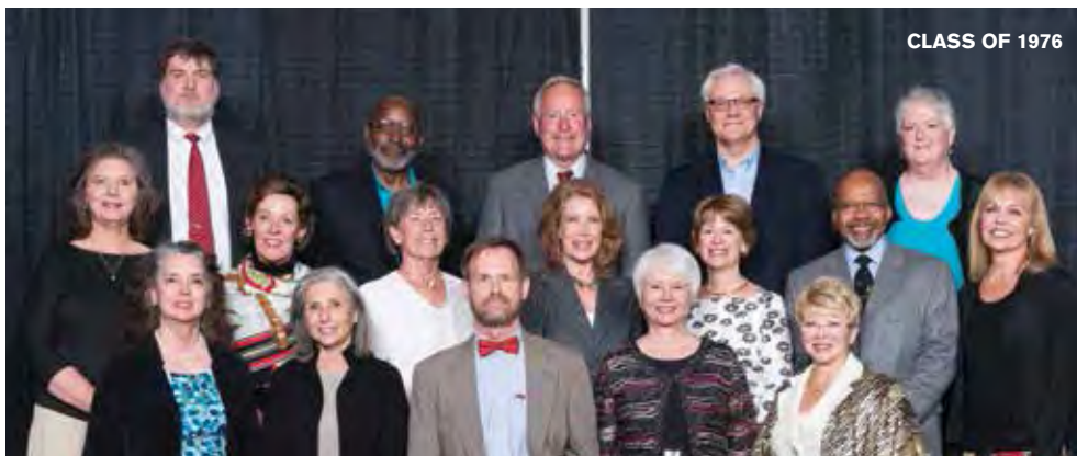
CLASS OF 1976