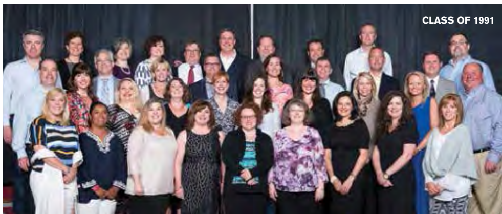
CLASS OF 1991