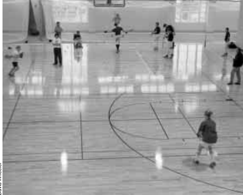
■ The softball and baseball teams practice in the upper gymnasium. The atrium (below) runs from concourse level to roofline.