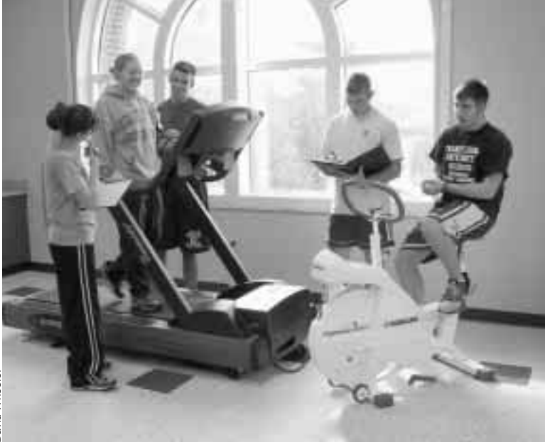
■ Students use the exercise physiology lab.